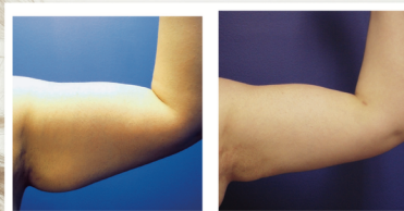
1 treatment | courtesy of Kevin Tehrani, MD