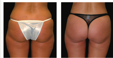
3 months post 1 treatment